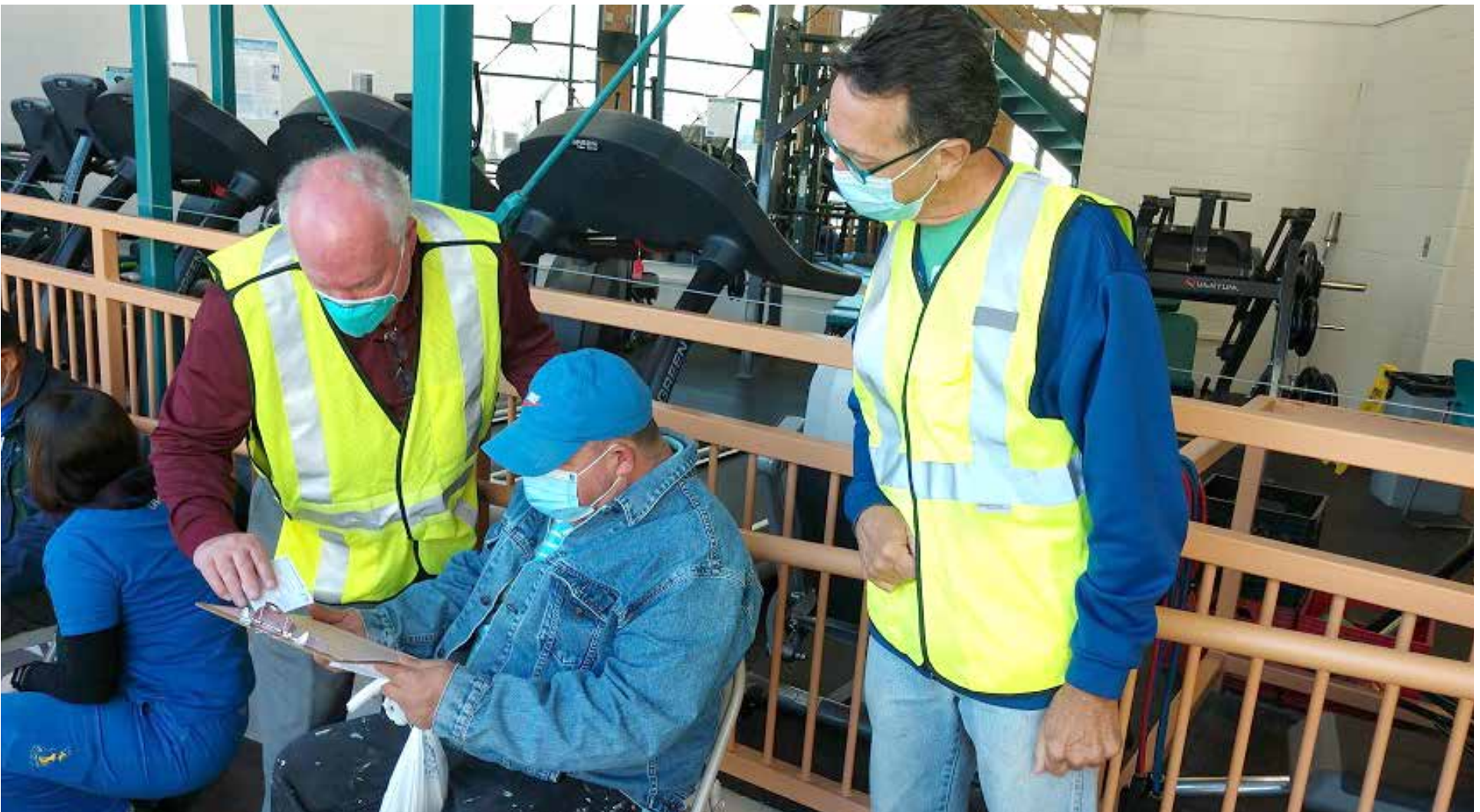
When the person received the vaccine, Truman Medical Center Nurses provided each of them basic instructions about potential side effect symptoms.