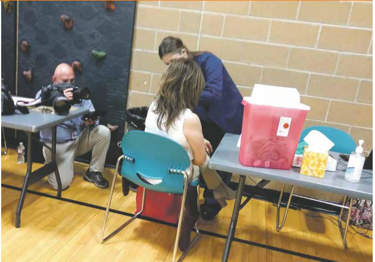
Many of the participants left the Tony Aguirre Community Center so happy after receiving their 2nd dose of the COVID-19 vaccine.

Muchos de los participantes dejaron el Centro Comunitario Tony Aguirre muy felices después de recibir su segunda dosis de la vacuna COVID-19.